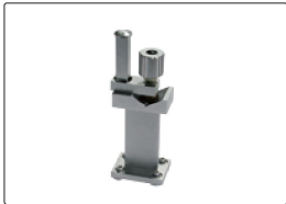
single V-stand (included)