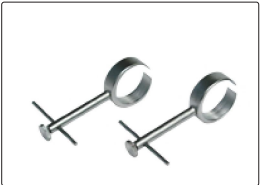
3-wires bracket (included)