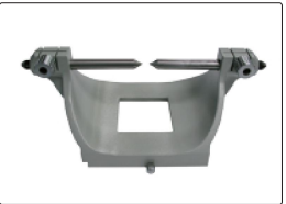
horizontal ejector pin bracket (included)