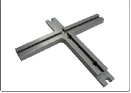
cruciform frame (included)