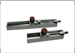
measuring block grinding frames (included)