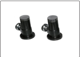
plane caps (included)