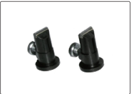
blade shape caps (included)