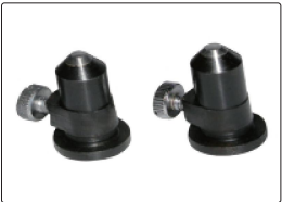
spherical caps (included)