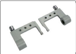
large measuring hook (included)