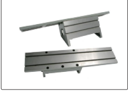
tilted fixed frame (included)