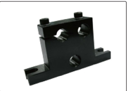
indicator gauge stand (included)