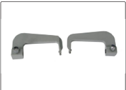
small measuring hook (included)