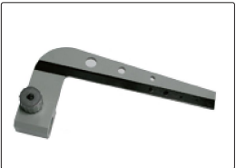
universal hook (included)