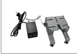
device electronic measuring (included)