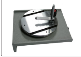
round floating table (included)